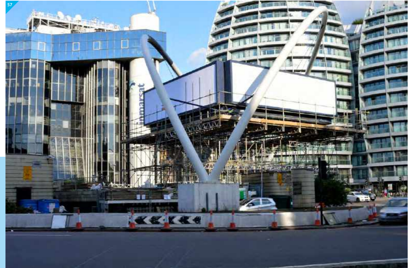
57. Old Street Station London UK QS Role, Cost Management and Mediation