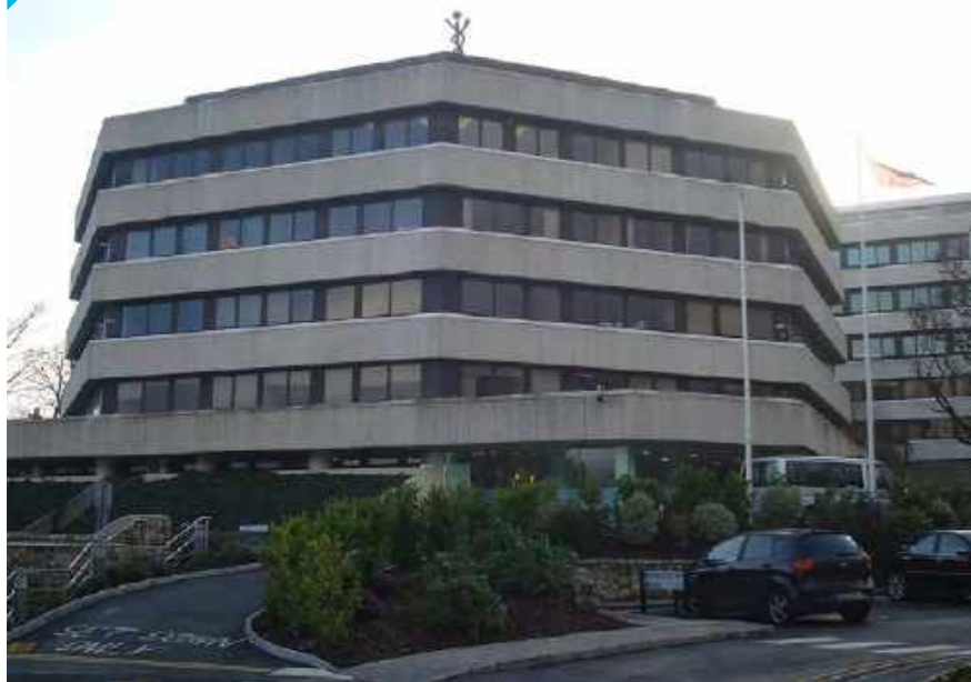
36. Black Rock Clinic Dublin Ireland M&E Dispute Advice & Preparation of Claims for Loss and Expense/Quantification of Damages