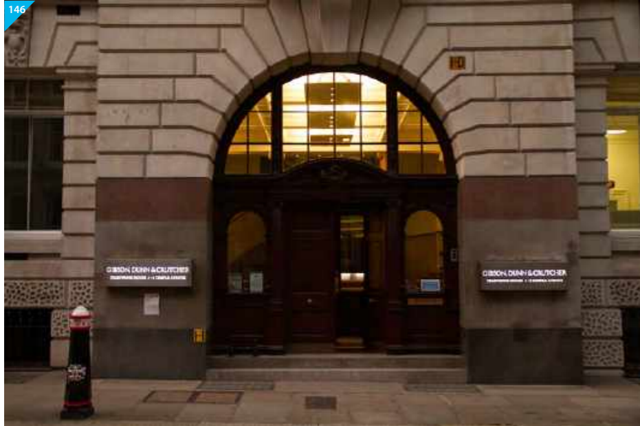
146. Telephone House London UK M & E Independent Witness