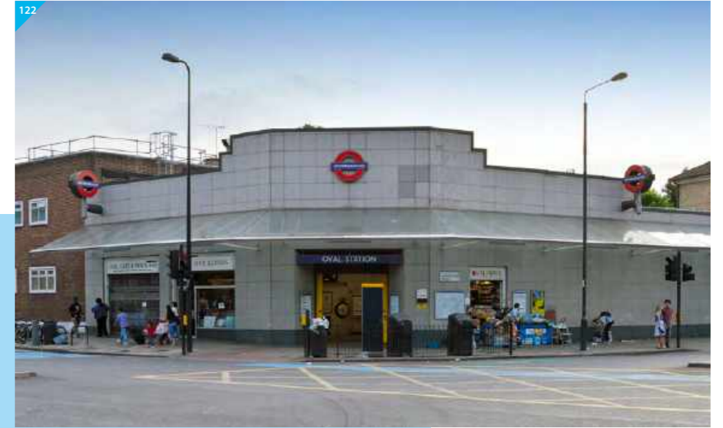
122. Oval Station London UK Adjudication, Dispute Resolution Services, Litigation Support, QS Role and Cost Management