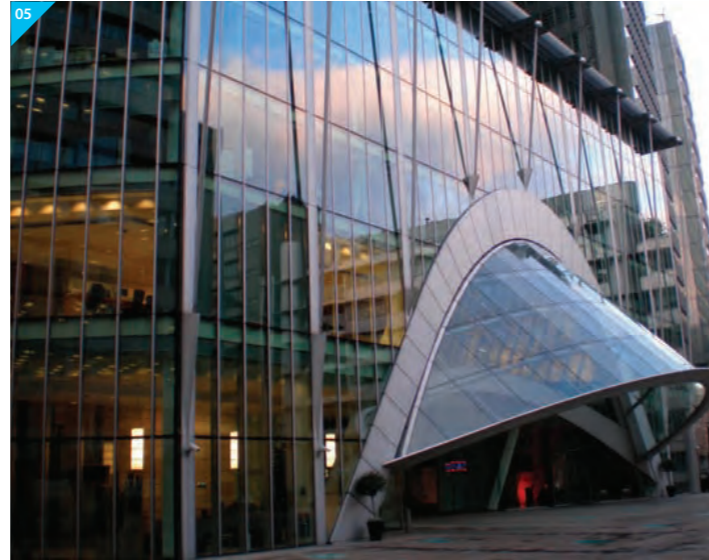
05. City Point London UK Pre and Post Contract QS Services