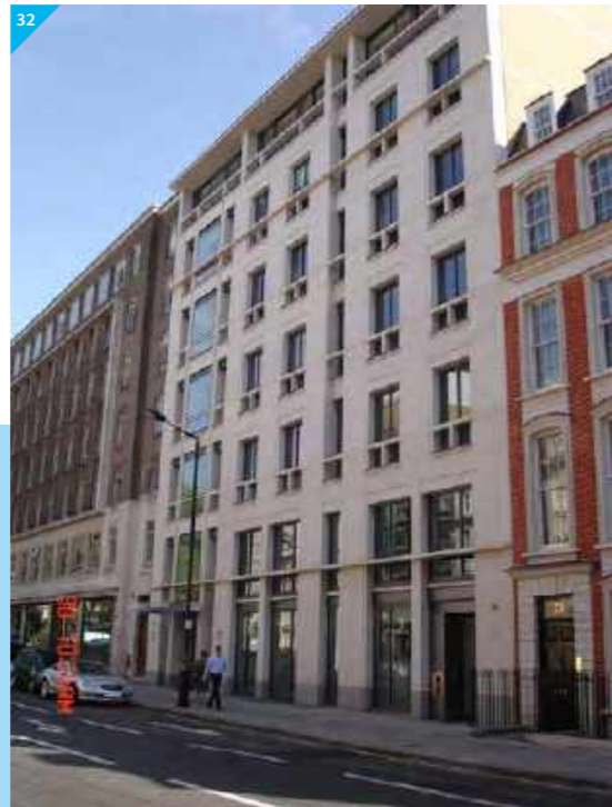
31. Burne House London UK Expert Witness Testimony & Quantification of Damages