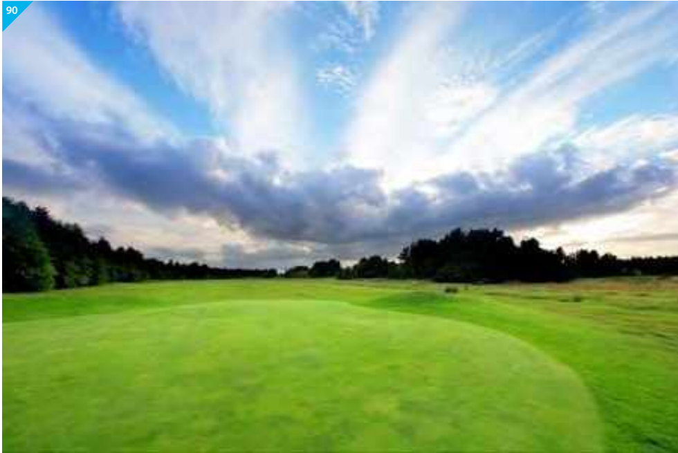
90. Bray Golf Club Wicklow IRL Dispute Resolution Services