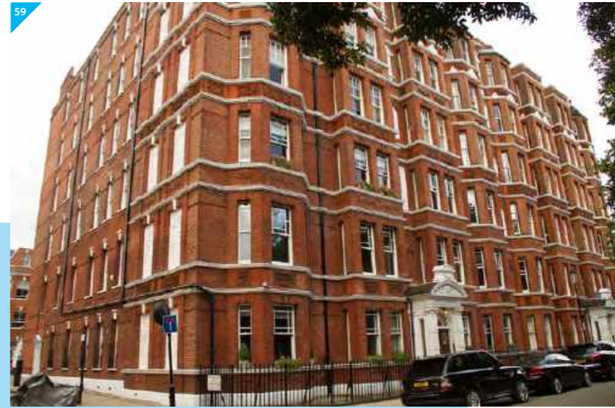
59. Carlyle Mansions London UK Dispute Resolution Services, Arbitration, QS Role and Cost Management