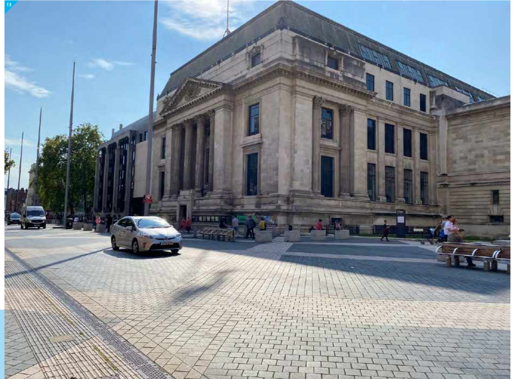
13. Science Museum London UK Contract Advisory, Variations & Final Account