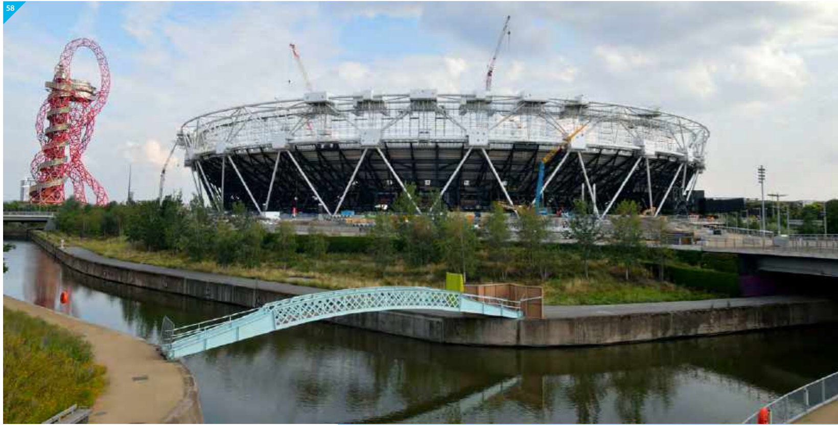
58. Olympic Stadium London UK Post Contract Services