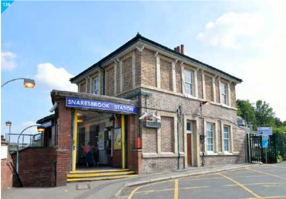
136. Snaresbrook Station London UK QS Role and Cost Management