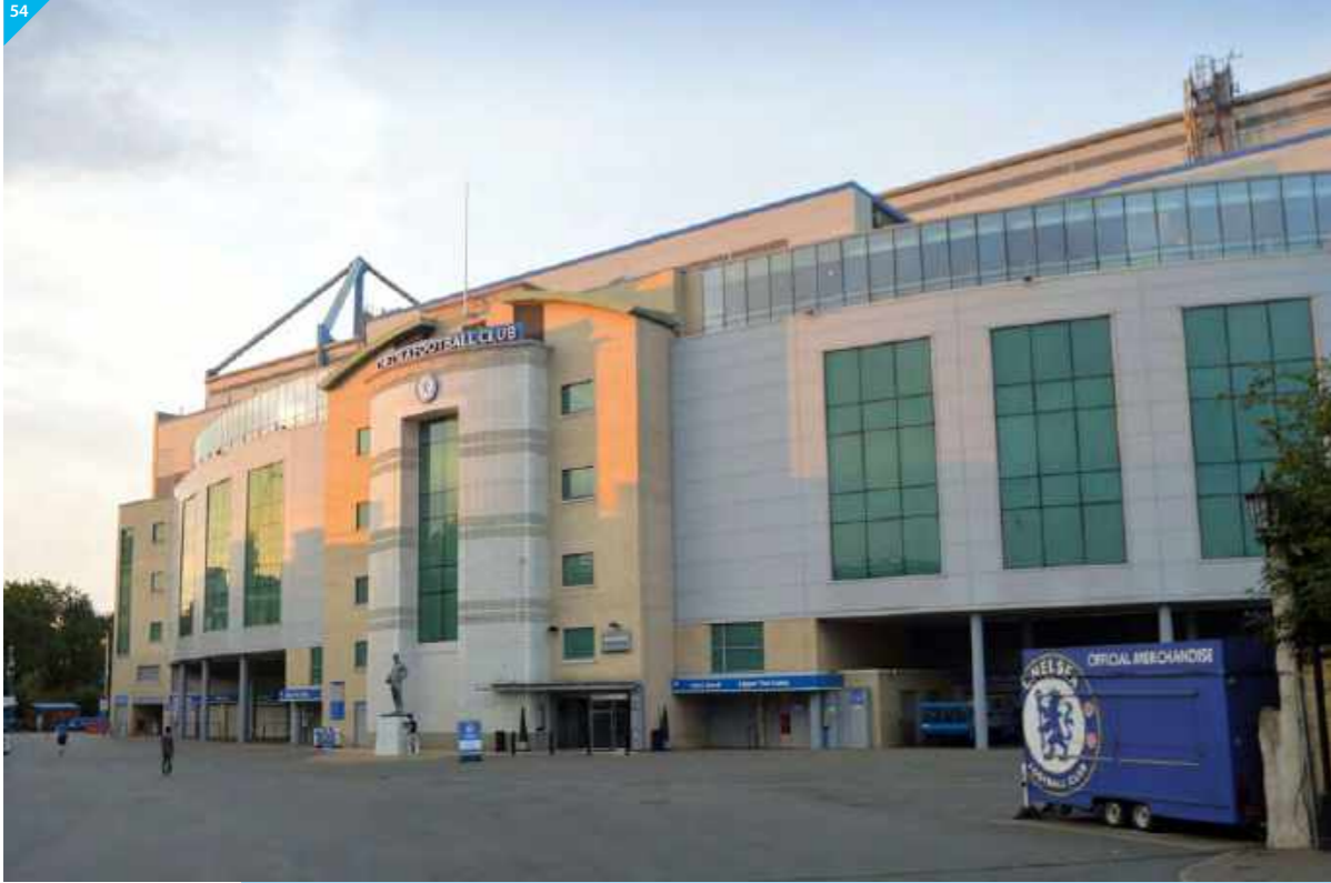
54. Chelsea Stadium London UK QS Role and Cost Management