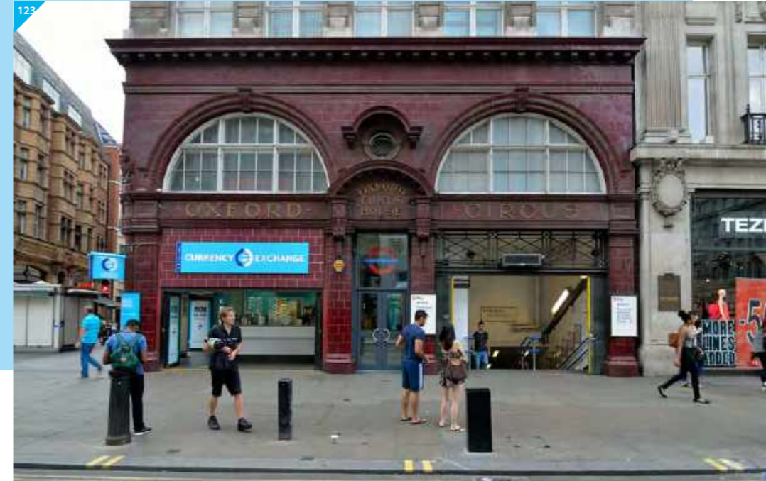
123. Oxford Circus Station London UK QS Role and Cost Management