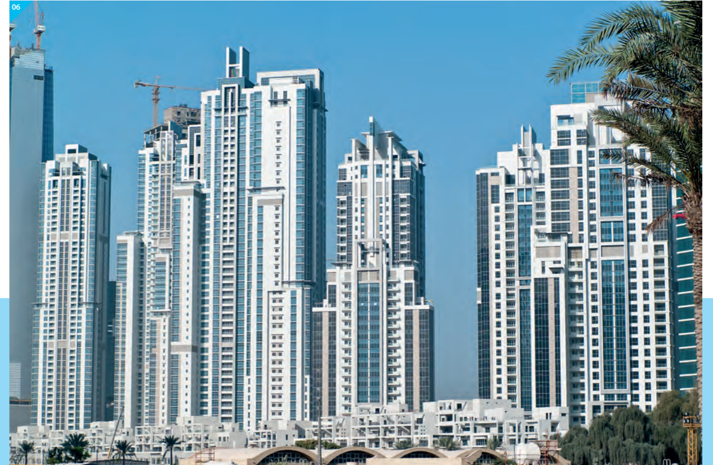
06. Executive Towers, Business Bay Dubai, UAE Remeasure & BOQ Production