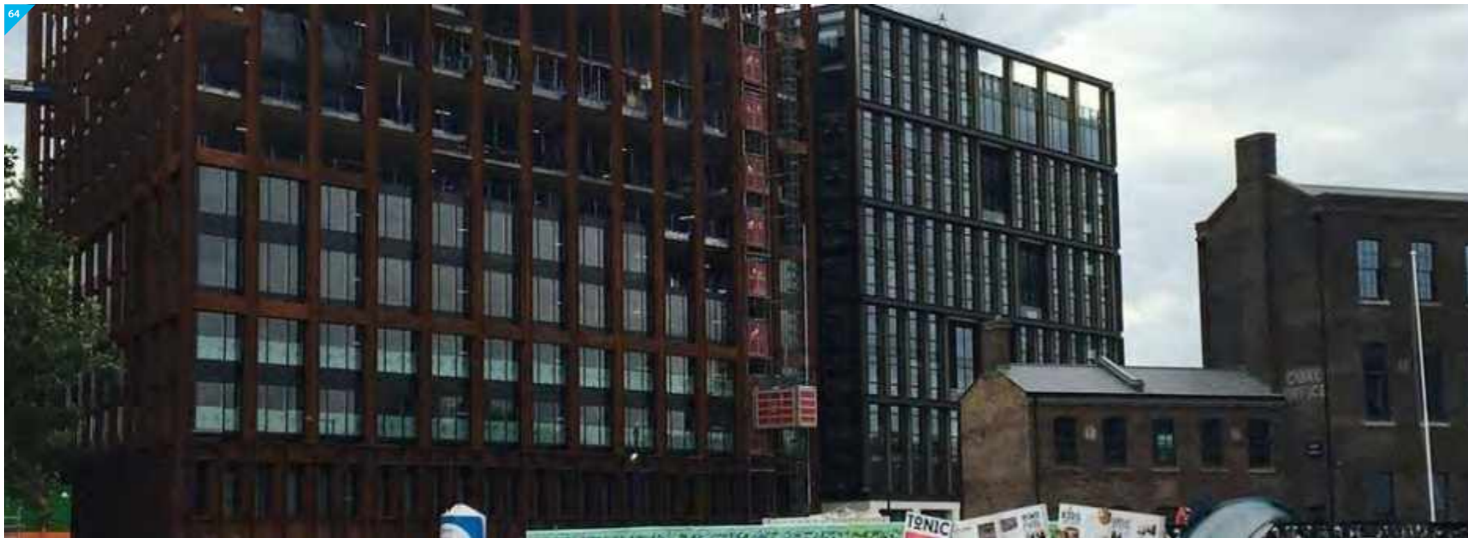
64. 6 St. Pancras Square London UK MEPH Cost Management