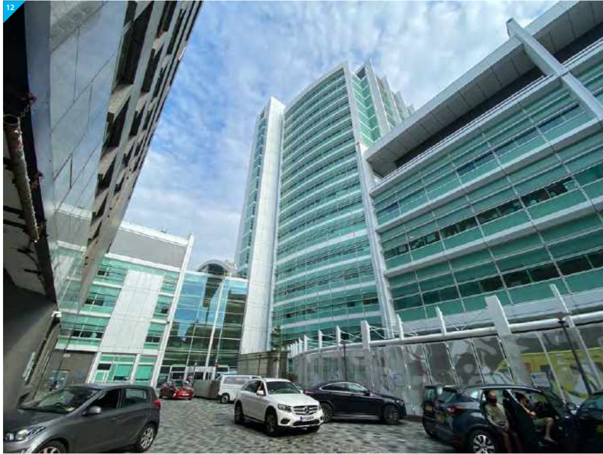
12. University College Hospital London UK Contract Advisory, Dispute Resolution, Extension of Time / Loss & Expense Submissions, Variations & Final Account, Forensic Delay Analysis