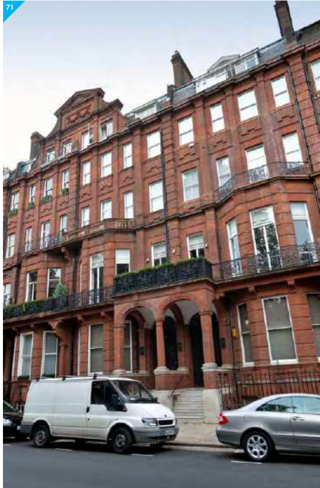
71. 41 43 Cadogan Square London UK Communal Boiler Systems Compliance