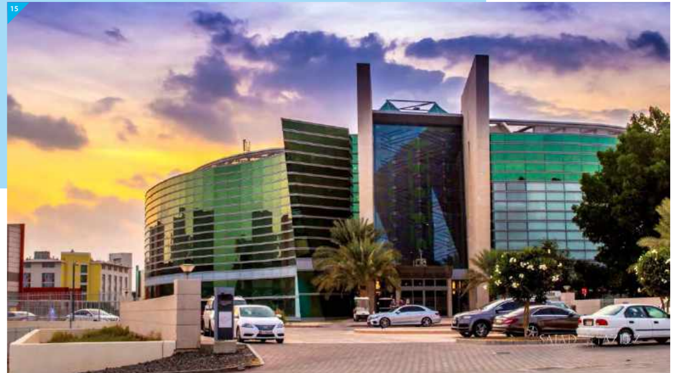
15. IT College Al Ain UAE QS Role