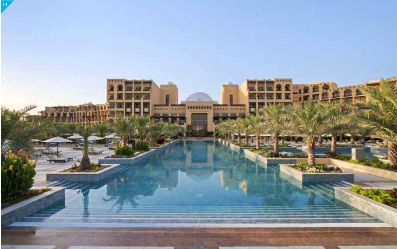
14. Hilton Hotel Ras Al Khaimah UAE QS Role, Claims & Dispute Resolution