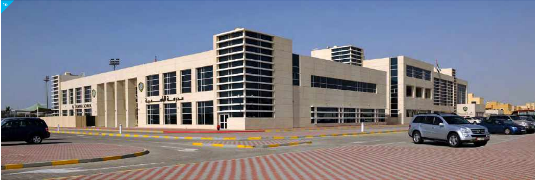
16. Al Yasminah School Abu Dhabi UAE QS & PM Role