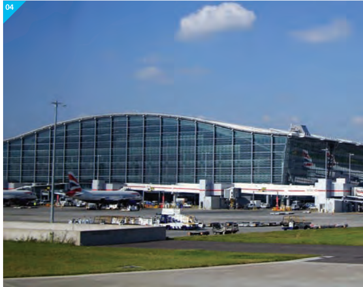
04. Heathrow Terminal 5 London UK MEP Post Contract QS Services