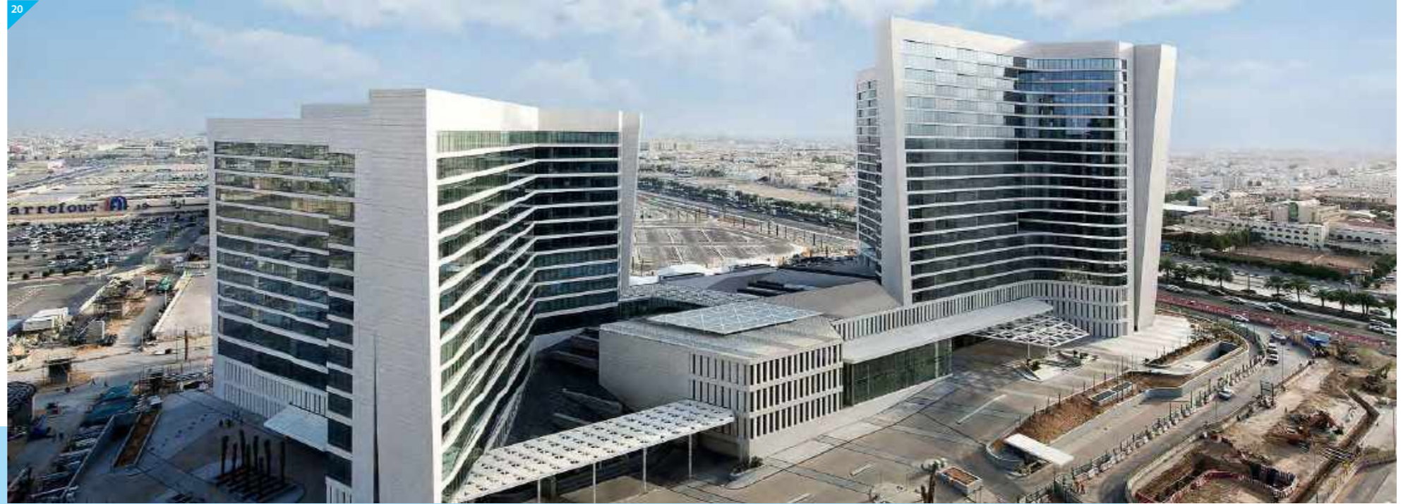
19. Abu Dhabi Plaza Tower Almaty, Kazakhstan QS Role, Claims & Dispute Resolution