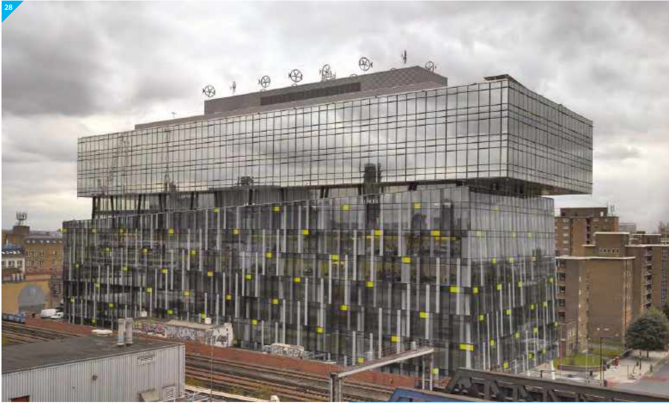
28. Palestra London UK Bank Monitoring Role