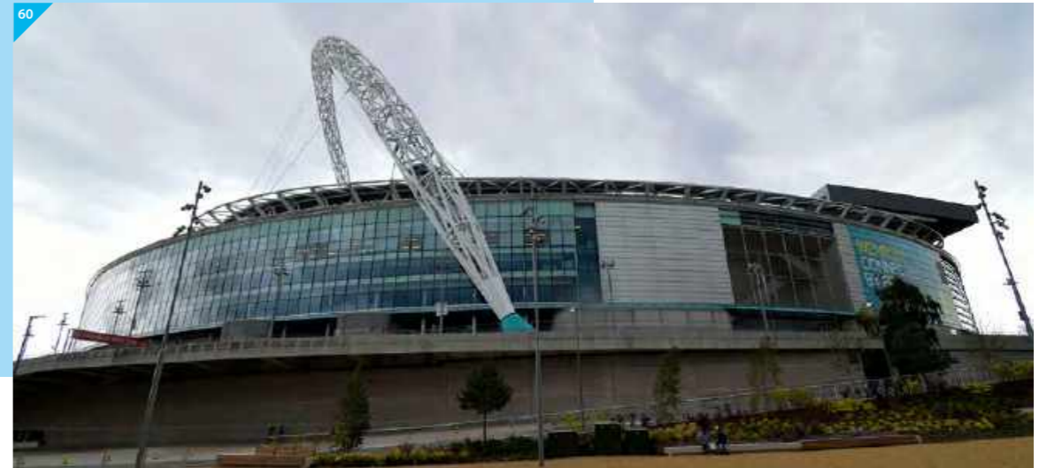
60. Wembley London UK Dispute Resolution and MEPH Cost Management