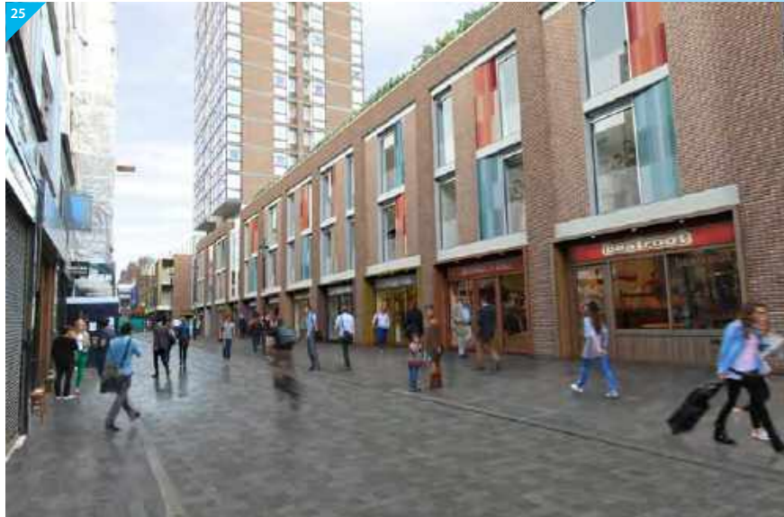
25. Berwick Street London Cost Consultant & Contract Administrator