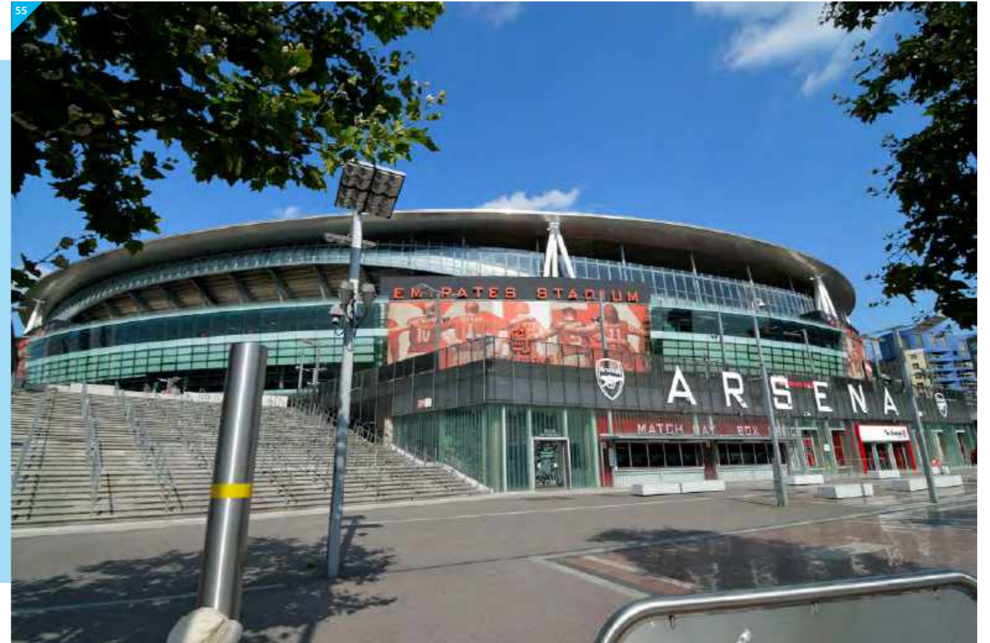
55. Highbury Square Development London UK MEP QS Role