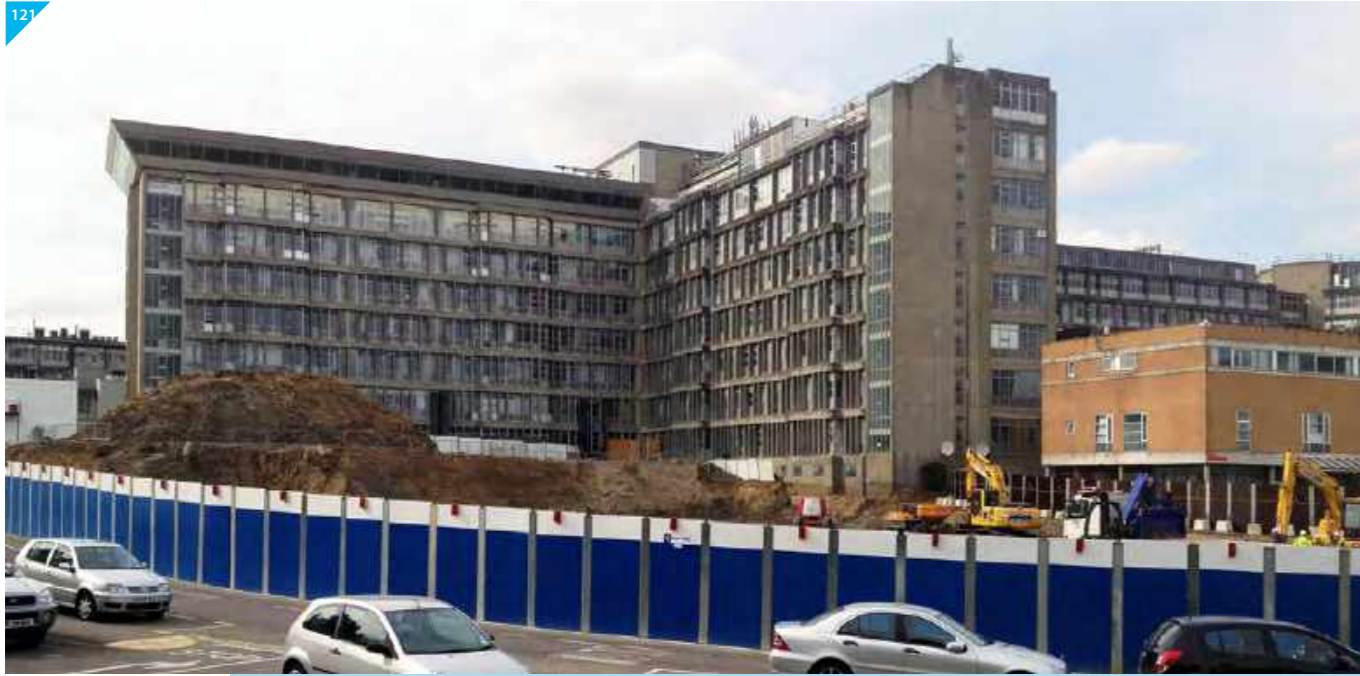
121. Northwick Park Hospital London UK Dispute Resolution Services, QS Role and Cost Management