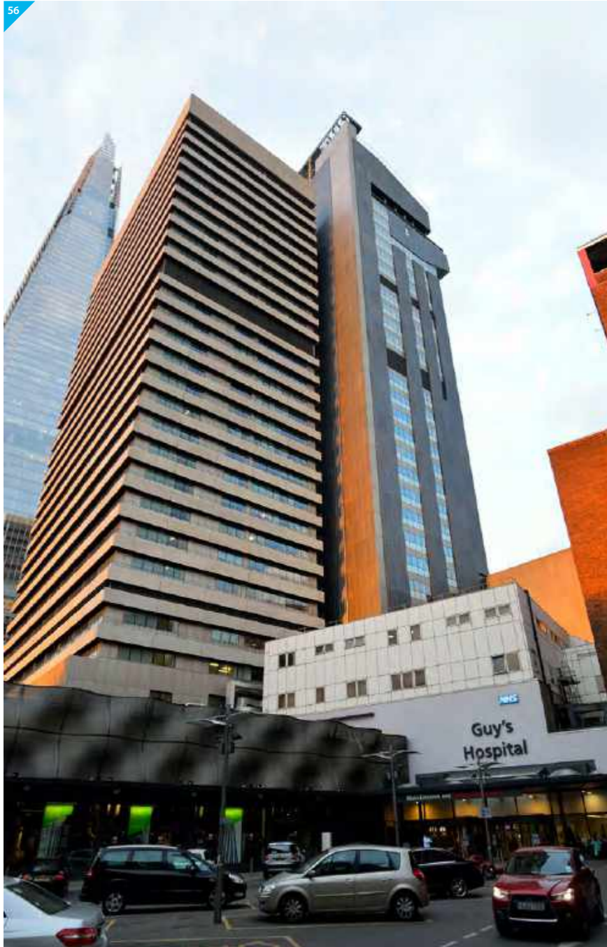
56. Guys Hospital Tower London UK Cost Planning and Feasibility Study